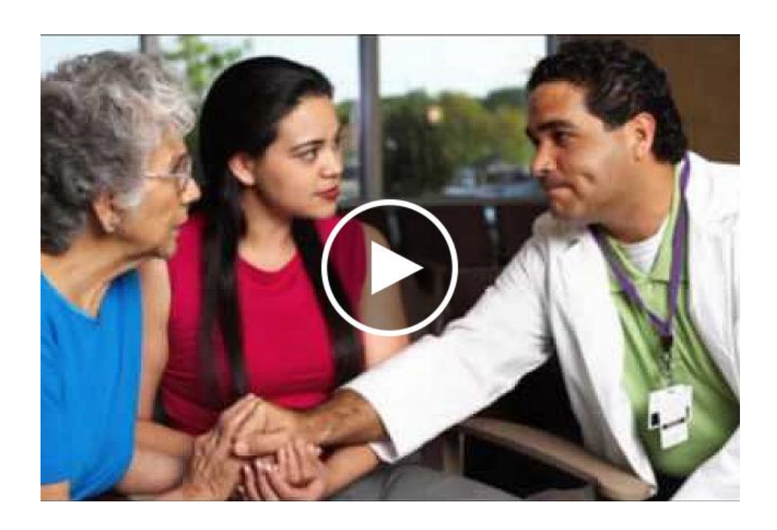
Part II: Talking Openly with Your Medical Provider (3:51)